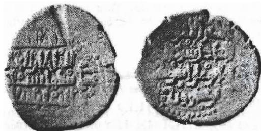
Fig. 1. The coin of Ashot b. Shāwūr I

Rev: Amīr the respectable / the just, protector of the sta / te Abū 'Alī Ashūṭ / bin Shāwūr.